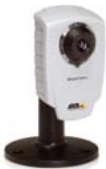
AXIS 207/207W/207MW Network Camera with camera stand - stand included