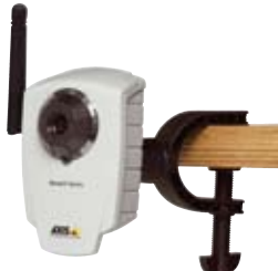
AXIS 207/207W/207MW Network Camera with flexible clamp - clamp included